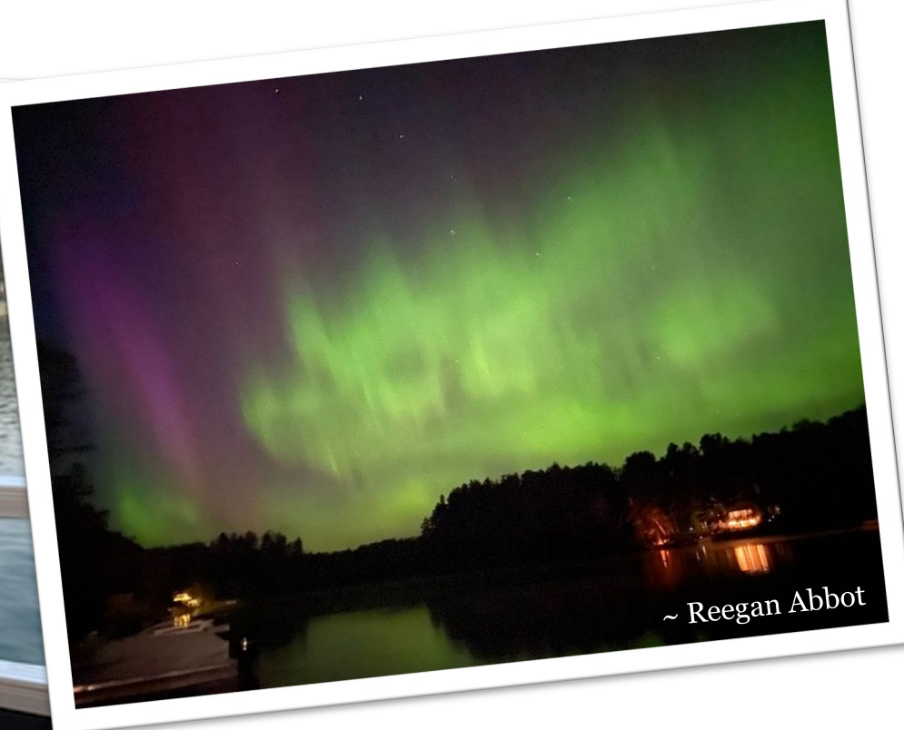
~ Reegan Abbot